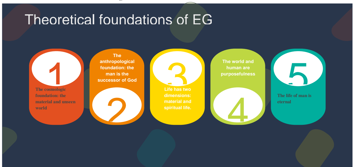
Figure 1: five theoretical foundations of EG

According to this basis, the creteria of humanity is one who establishes his life based on monotheism and the obligation of the Sharia in the light of believing in God, and arranging all the behaviors based on that belief. He sees the world as the presence of God, treats Him as a sinner, while at the same time benefits from material life. He is originally oriented to the Hereafter. The body is as a tool for the cultivation of the soul to reach the purpose of creation and approaching God. "GE" is "living in the color of God" and based on divine orders; achieving the final purpose of life, to approach God and to fall into divine moral. The result will be the pure and clean life and the salvation in the hereafter.